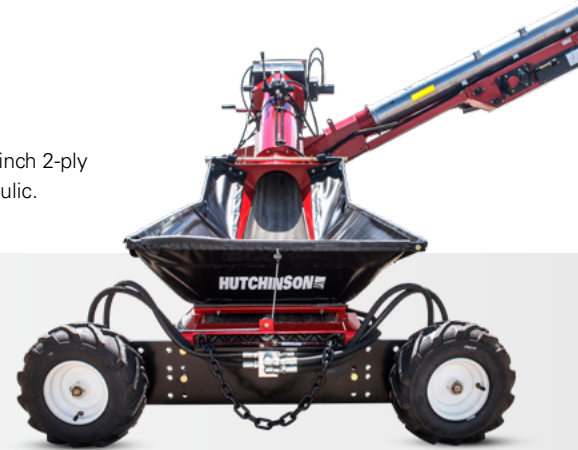
HCX 1590 SWINGAWAY HOPPER

The HCX 1535 top drive belt conveyor features an a-frame undercarriage, a 10" tube and 15" inch 2-ply chevron belt with a nylon slider back. The HCX 1535 top drive is available in electric or hydraulic.